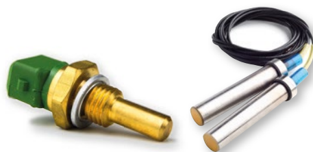
Potting of Sensors