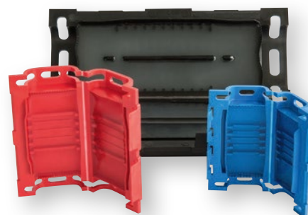
Potting of Cable Joints