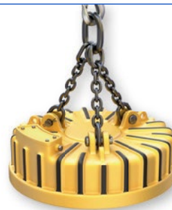
Potting of Lifting Magnets